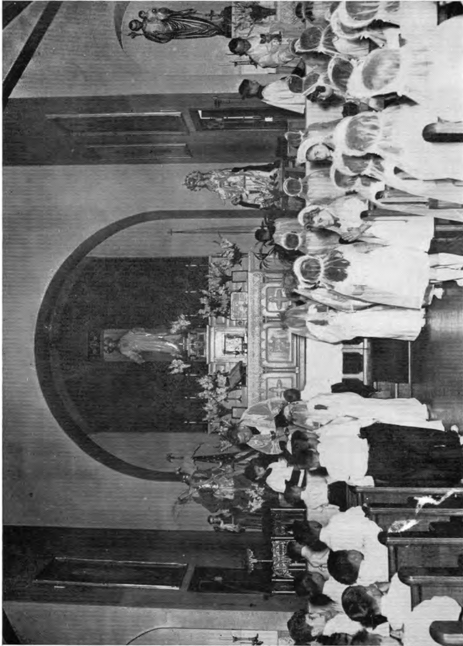
THE HAPPIEST DAY OF THEIR LIVES FIRST HOLY COMMUNION