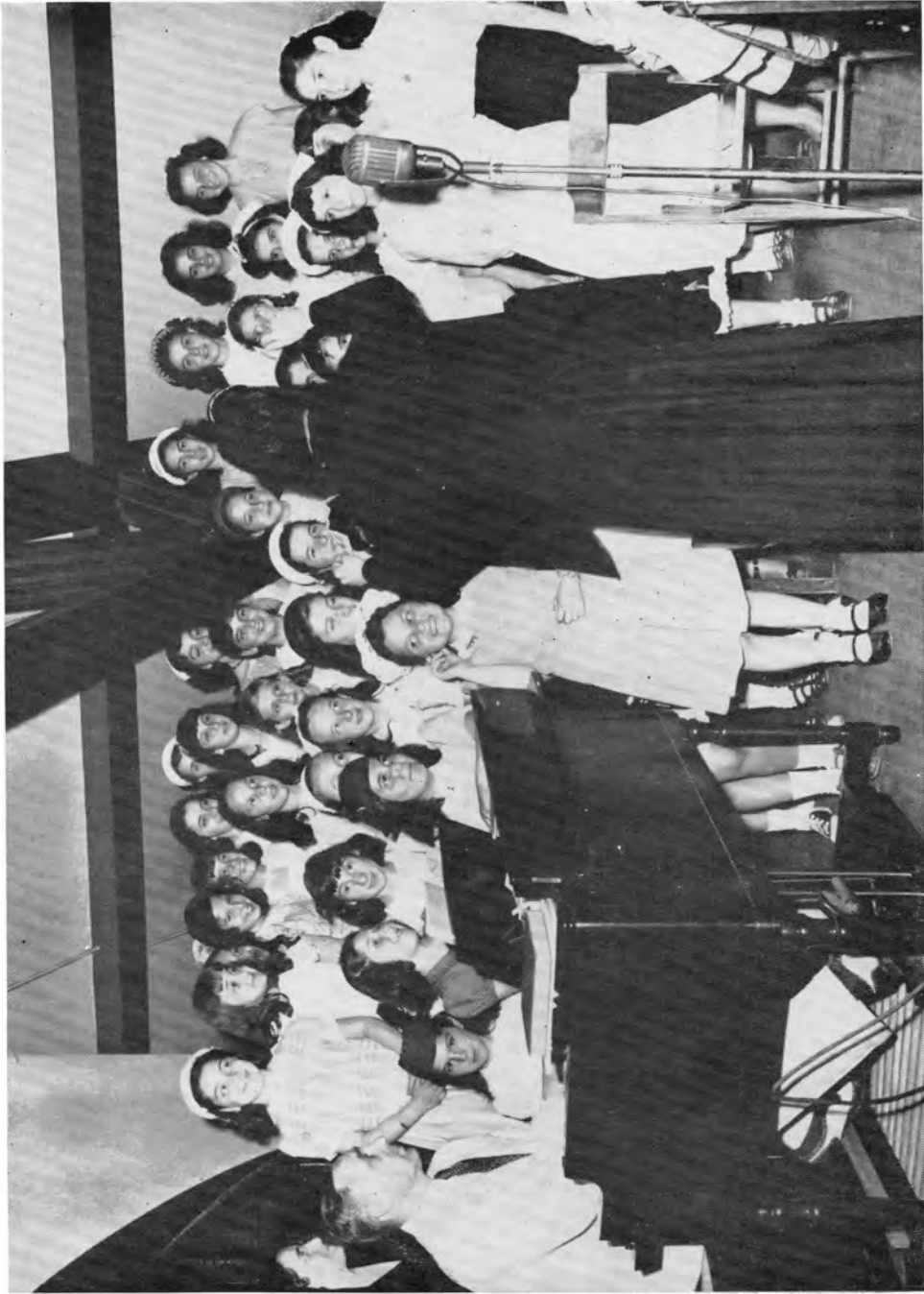
CANZONE, DOLCEZZA, BELLEZZA, ED INNOCENZA ST. CECILIA'S CHOIR BROADCASTS FROM THE CHOIR LOFT AT SACRED HEART CHURCH